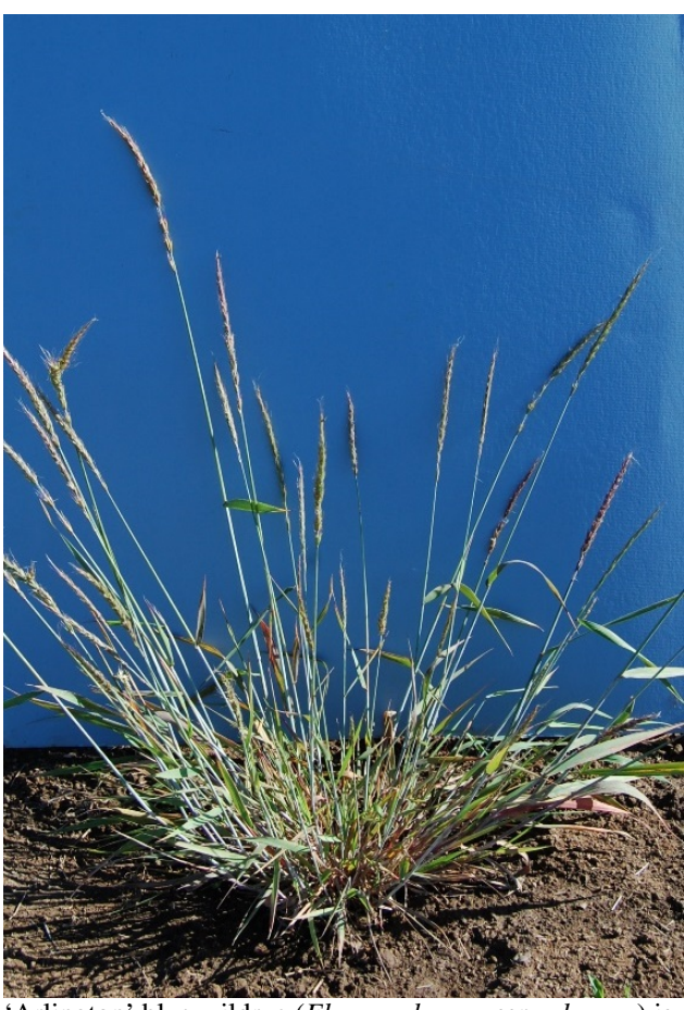
'Arlington' blue wildrye ( Elymus glaucus ssp. glaucus ) is a grass cultivar released in 1995 in cooperation with the Oregon Agricultural Experiment Station and the Washington Agricultural Research Center.

A Conservation Plant Release by USDA NRCS Corvallis Plant Materials Center, Corvallis, Oregon